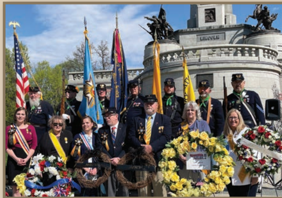
Lincoln Tomb Wreath Presenters