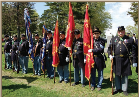
Lincoln Tomb and Stephenson Honor Guard