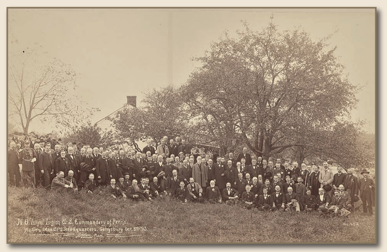
PA MOLLUS Gathering At General Meade's Gettysburg HQ, 1893.